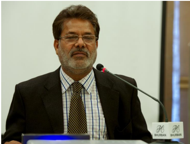
Figure 4: Muhammad Mushtaq, Joint Secretary, Legislation, National Assembly