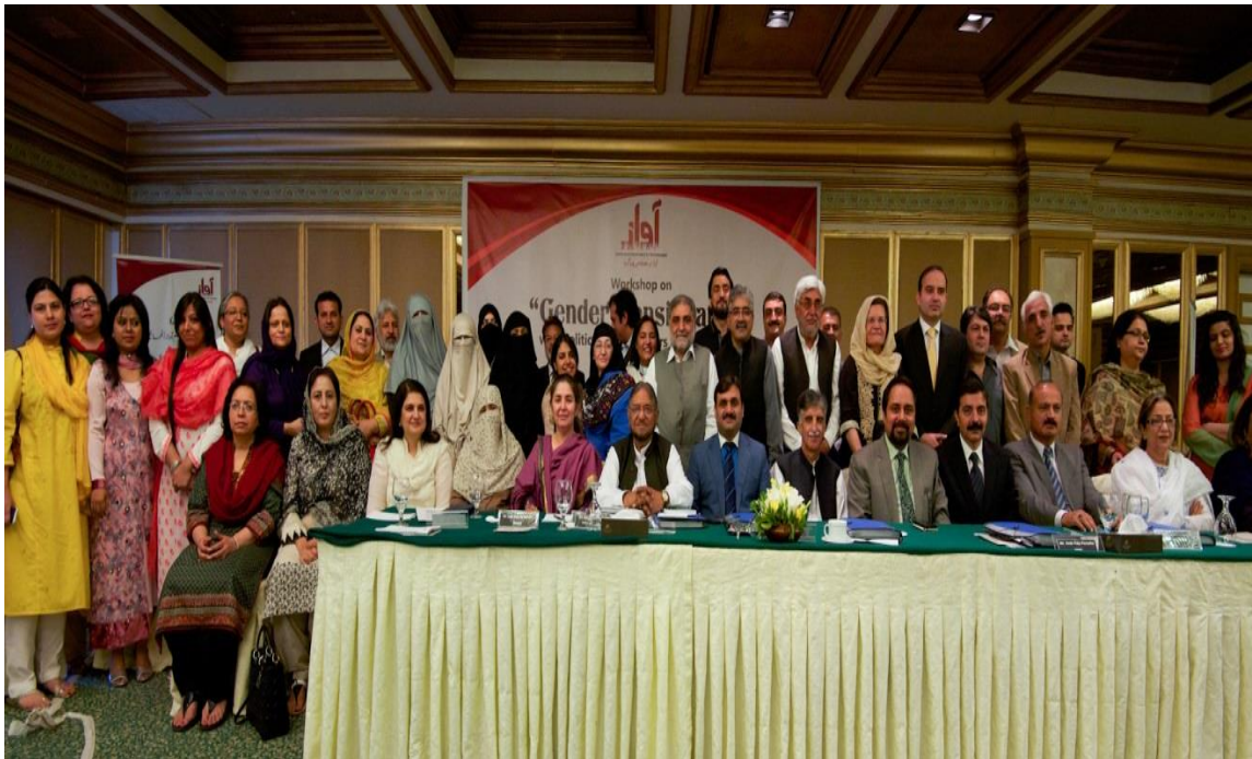
Figure 5: Group photo of participants